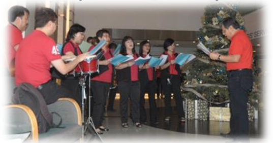
Quick rehearsal before the main event