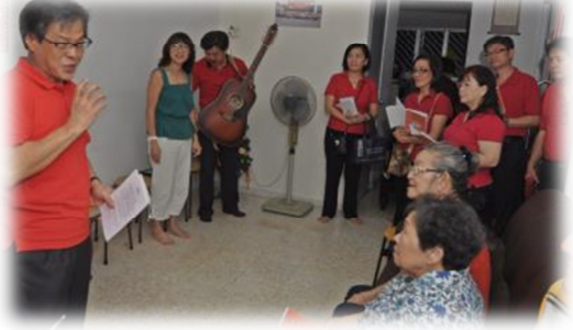
1st home the Dialect Team visited in Jurong West

the YMCA event but unofficially, they had an impromptu performance at a house-warming about a week earlier at a member's house.